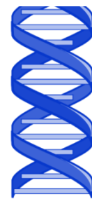
Figure 3 Double Helix

For Indigenous peoples, a double helix model of parallel and mainstream sport systems with cross links at various levels of achievement and competition has been proposed. 111 Both systems advance athletes through their own structures. It illustrates a system for Canada's Indigenous Peoples that is equal to the mainstream system, self determined, separately funded, and culturally owned, relevant and appropriate. The cross bars are points where the Canadian mainstream system connects and contributes to the Indigenous sport system but where, to date, the power is unequal 111 and navigating the crossing of these connecting points pose challenges for some Indigenous athletes and officials as they deal with cultural tensions. 82 The Indigenous Games pathway increases participation at all levels 45,136 through the provision of cultural sporting experiences, training for leaders, volunteers, recreation directors, coaches. It