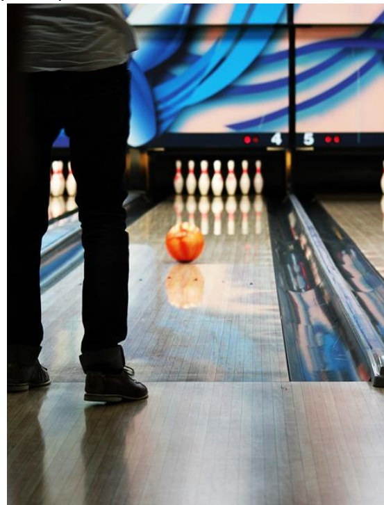
Canadians will be referred to as newcomers throughout the report.

A social-ecological model, depicted in Figure 2, illustrates the complex and multidimensional factors that facilitate and constrain sport, physical activity and recreation decisions and behaviour. It demonstrates how individuals influence and are influenced by those around them and depicts the relationship between behaviours and individual, interpersonal, organizational, community and social systems. The social-ecological model shifts policy focus from single issues, risk factors and linear causality to a more holistic way of examining the contexts in which people live and interact. 28,29 This report examines policy, programming and, to some extent, environmental interventions and practices that have the potential to encourage sport participation.